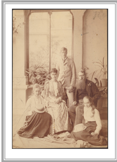
Portrait of Lady Loch with her family between 1884 and 1889